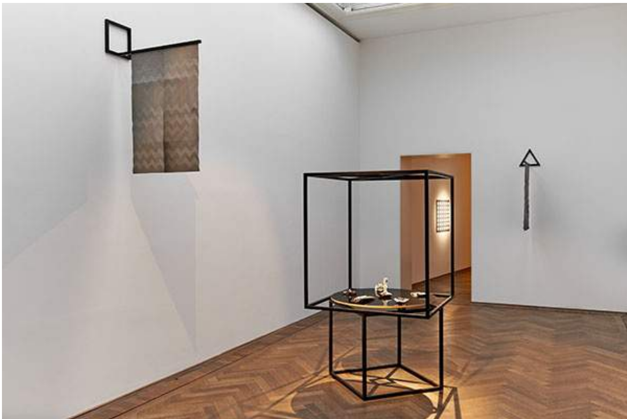
Vincent Meessen and Thela Tendu, "Patterns for (Re)cognition" installation views at Kunsthalle Basel, 2015